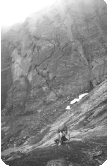
Hiking in the White Mountains